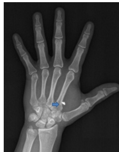
Figure 3. Image of a metal piece in the right hand anterior-posterior radiograph (blue arrow)

The most common FB in all patients was needle by 51.9% followed by metal piece by 30.4%. The most common FB in group 1 was needle by 79.4% followed