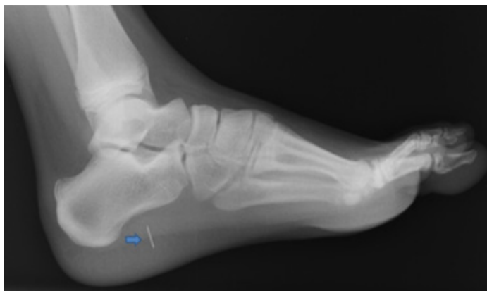
Figure 2. Image of a needle in the sole of foot on right foot lateral radiograph (blue arrow)